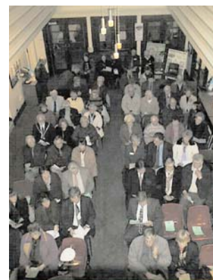
Airport Carol Service

Once again at the risk of boring you all I would like to thank all those who contributed to the success of the evening of 15th December, the appeal fund or both, without which none of this would have been possible for the